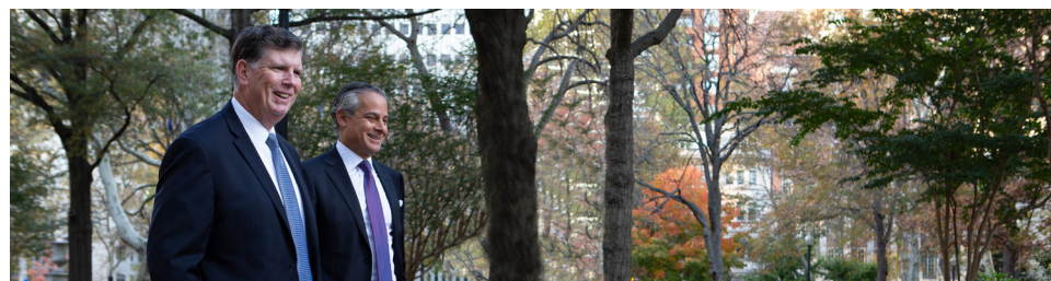
Relationship + Respect = Results

Raynes & Lawn is recognized not only for securing outstanding results, but also for its commitment to each client. Our firm prides itself on representing people, not "handling cases." While the firm has secured billions of dollars in recoveries, it has done so while shunning headlines to protect the dignity and confidentiality of our clients.